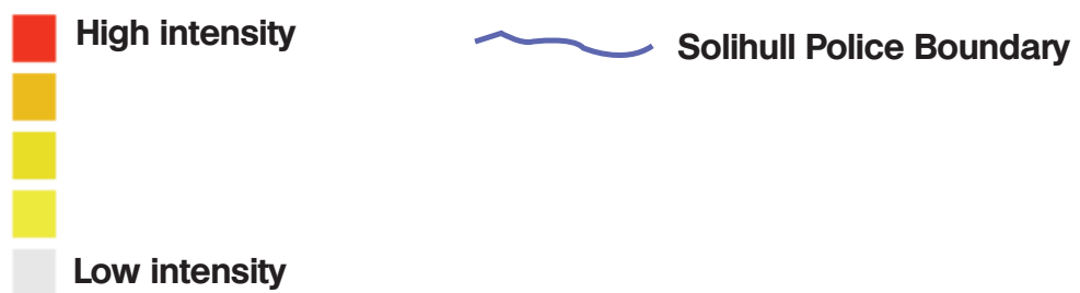
Figure 1 above it is clear that the Northern neighbourhoods are showing as the hotspot areas for Criminal Damage for the year 2008