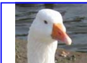
Domestic Goose All Orange bill