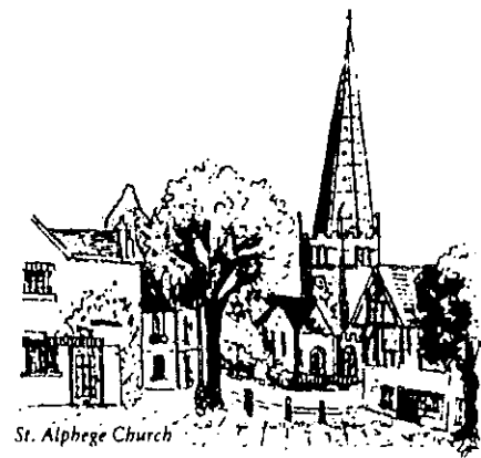
St. Alphege Church

(More Rural Route By-passing Town Centre)