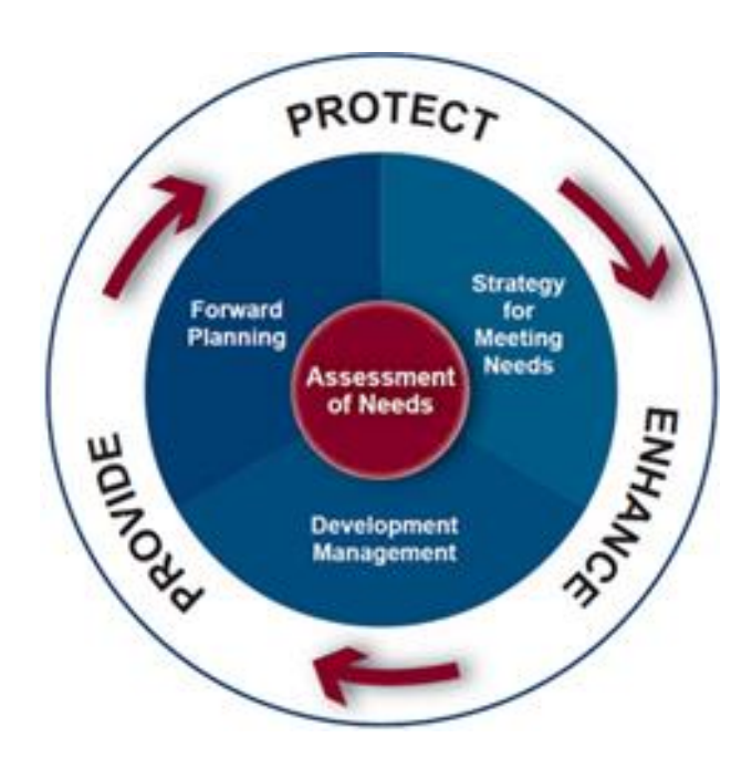
Figure 1: Sport England themes

To provide new playing pitches where there is current or future demand to do so