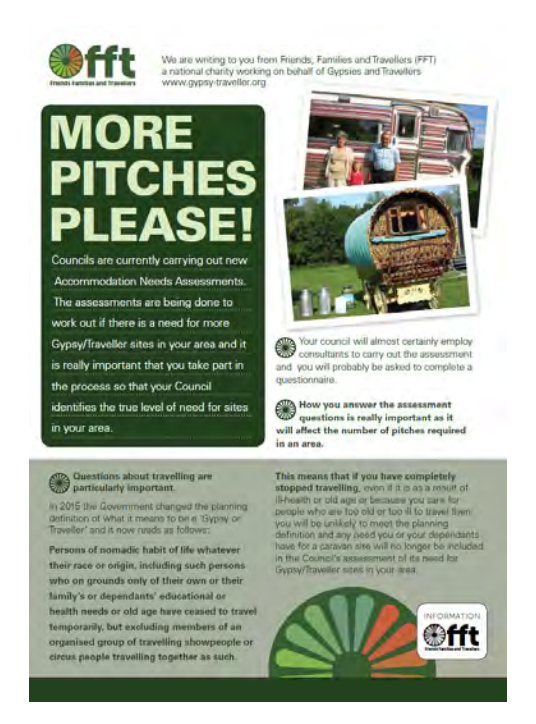
Figure 5 - Friends, Families and Traveller Leaflet