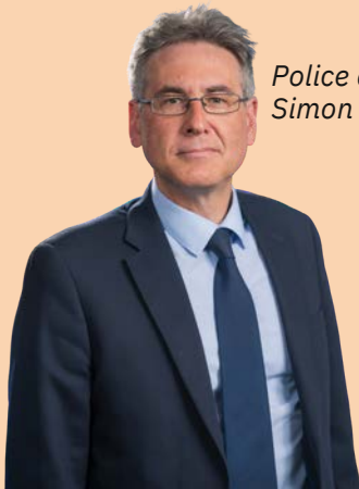
Police and Crime Commissioner Simon Foster

West Midlands Police has had a challenging decade. Government cuts have led to 2,200 fewer officers on our streets and the budget reduced by £175m during the period up to 2020. This is one of the biggest cuts that any police force has faced.