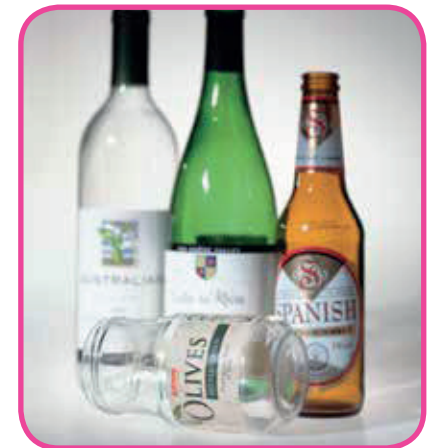
Glass in the mixed recycling bin