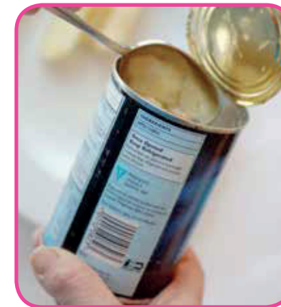
Food, residue, e.g. greasy pizza boxes