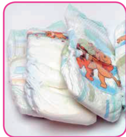
Household rubbish e.g. nappies

Please do not place any of these items into the recycling 'If in doubt—leave it out'