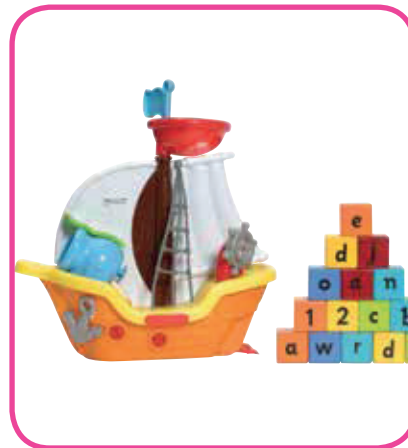
Hard plastics e.g. toys, CDs, plant pots