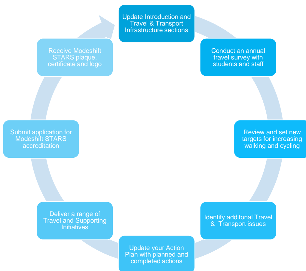
Figure 4 - Modeshift STARS Cycle

Modeshift STARS is a continuous process of planning, doing and reviewing. Each academic year your school has three opportunities to apply for STARS accreditation which fall at the end of each full term. However, SMBC prefer to review STARS accreditation in July, at the end of the school year. The Modeshift STARS Cycle displayed below sets out the process for getting accredited.