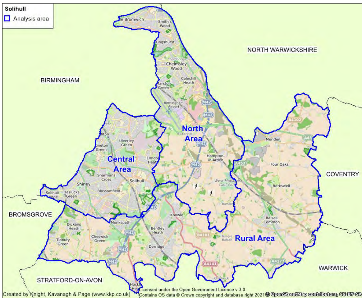
Figure 1.1: Map of Solihull

For a map showing the analysis areas, please see below.