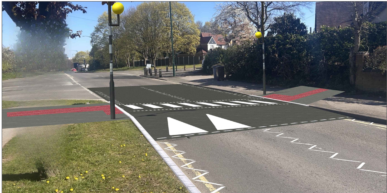
PROPOSED LAYOUT *5