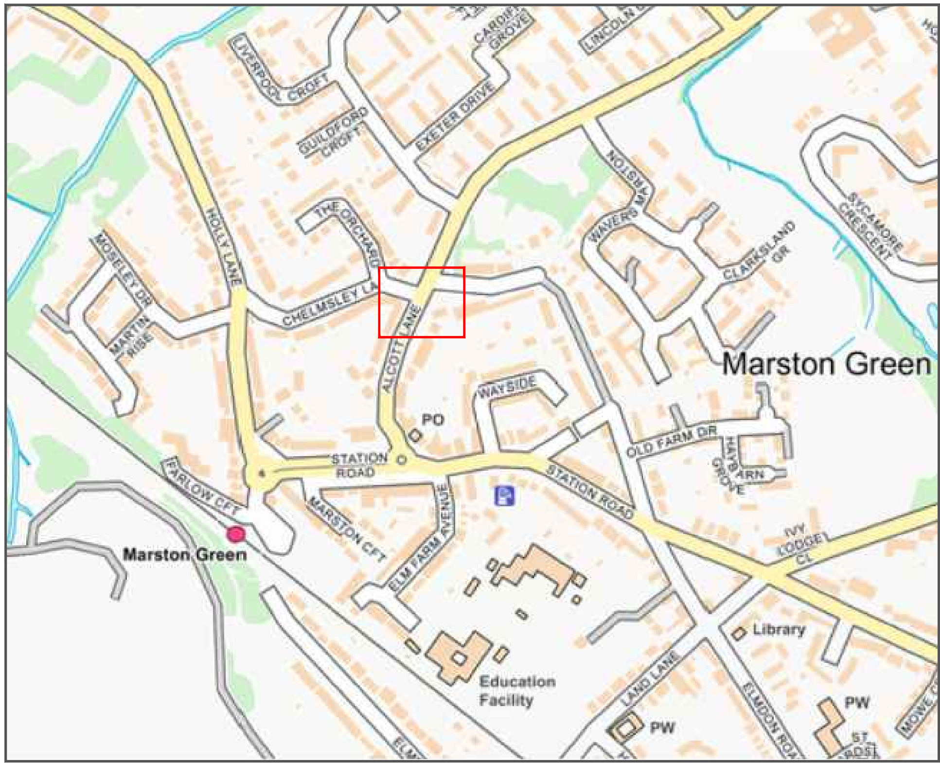
LOCATION PLAN SCALE (N.T.S)