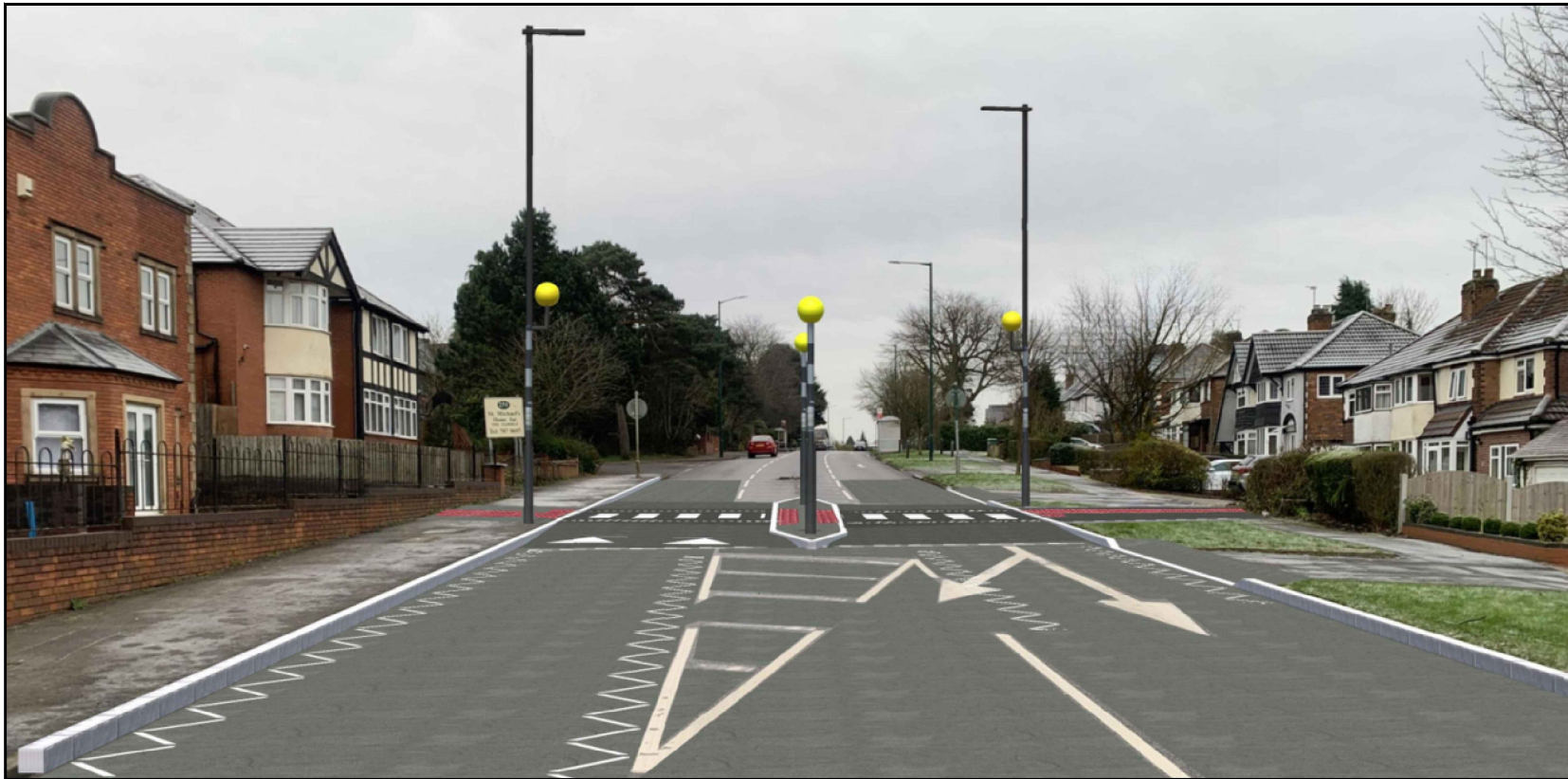
PROPOSED LAYOUT *5