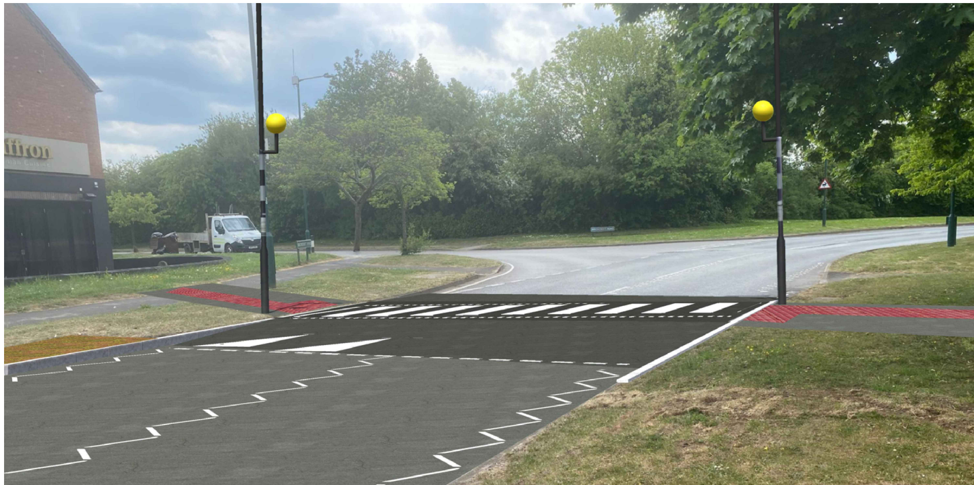
PROPOSED LAYOUT *5