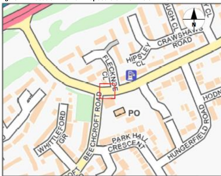
Figure 1.1: Location Plan of Proposals on Parkfield Drive