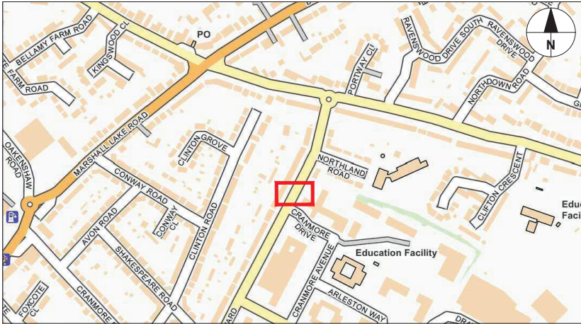
LOCATION PLAN SCALE (N.T.S)