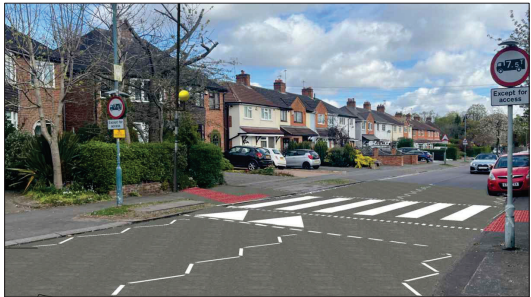
PROPOSED LAYOUT *5