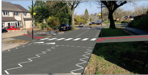
PROPOSED LAYOUT *5