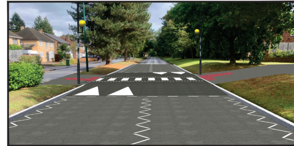
PROPOSED LAYOUT *5