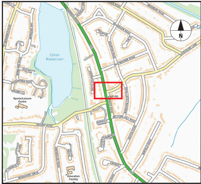
LOCATION PLAN SCALE (N.T.S)