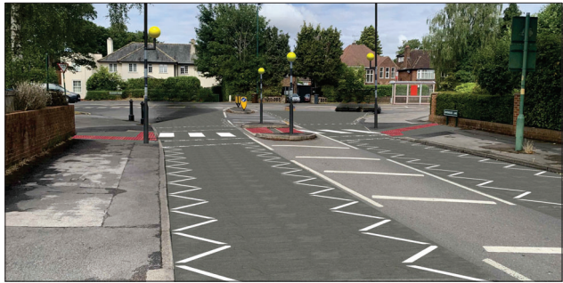
PROPOSED LAYOUT *5