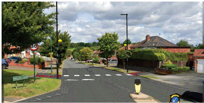
PROPOSED LAYOUT *5