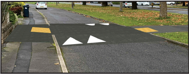
PROPOSED LAYOUT *5