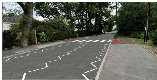
PROPOSED LAYOUT *5