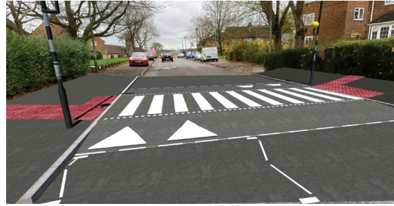
PROPOSED LAYOUT (SEE NOTE 5)