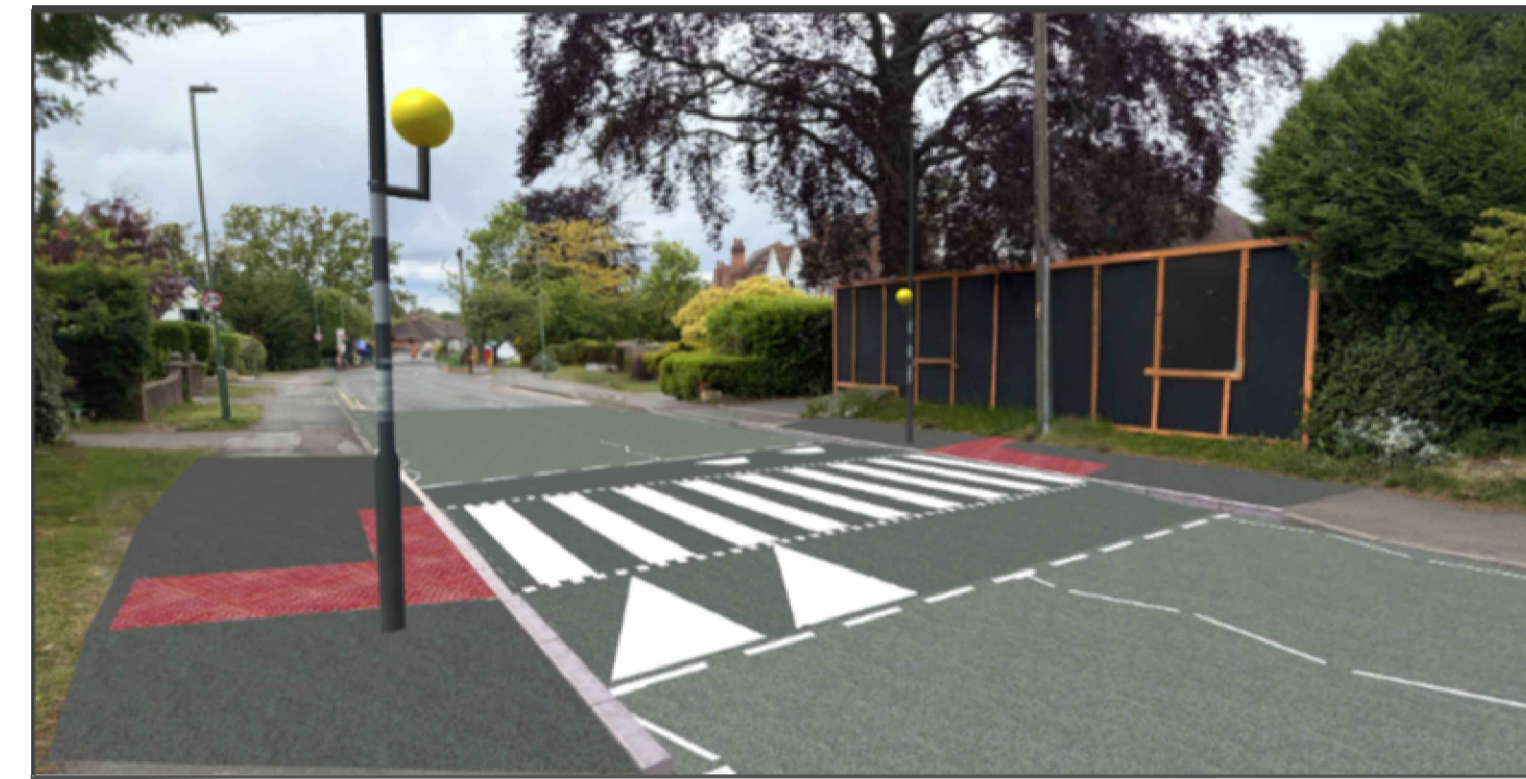
PROPOSED LAYOUT *5