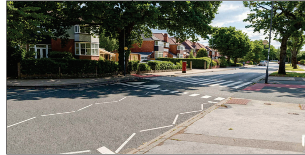
PROPOSED LAYOUT *5