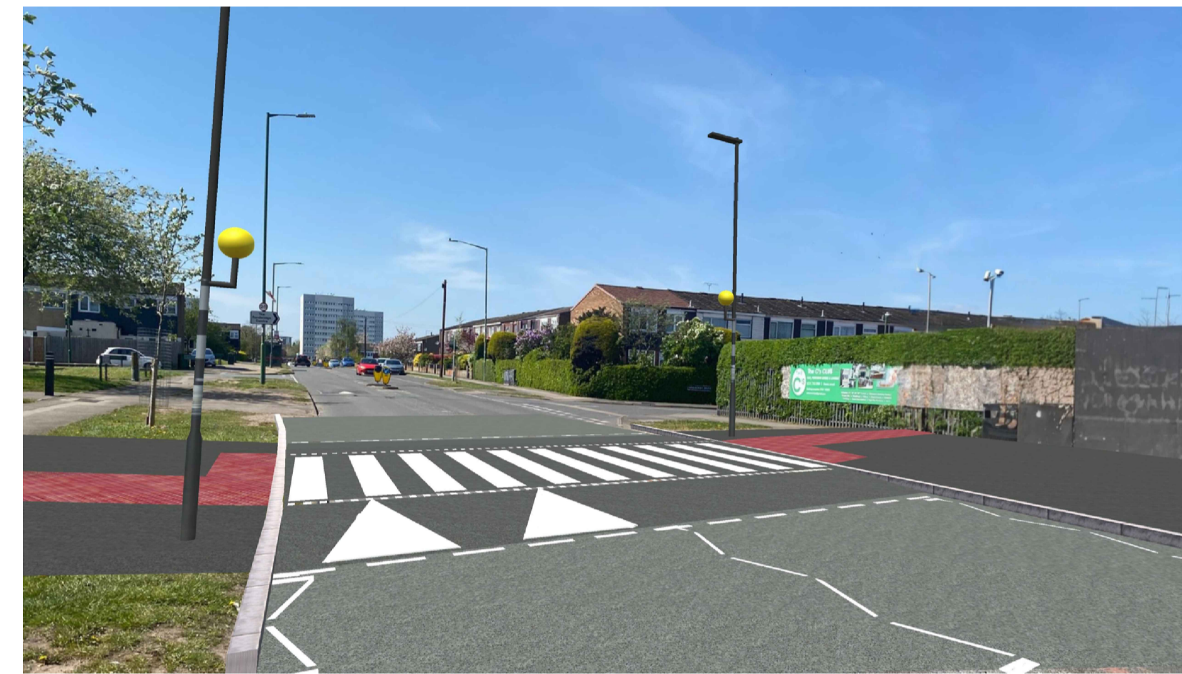
PROPOSED LAYOUT *5