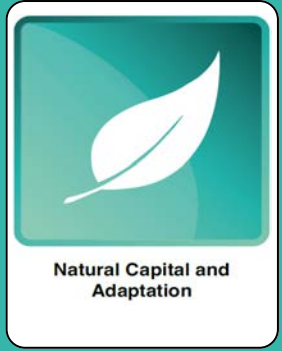
Natural Capital and Adaptation