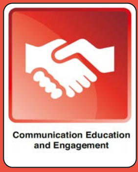
Communication Education and Engagement