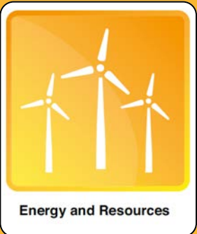
Energy and Resources