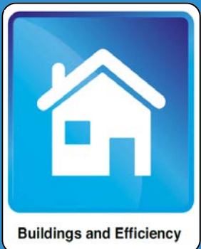
Buildings and Efficiency