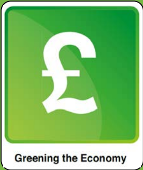
Greening the Economy