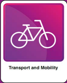
Transport and Mobility