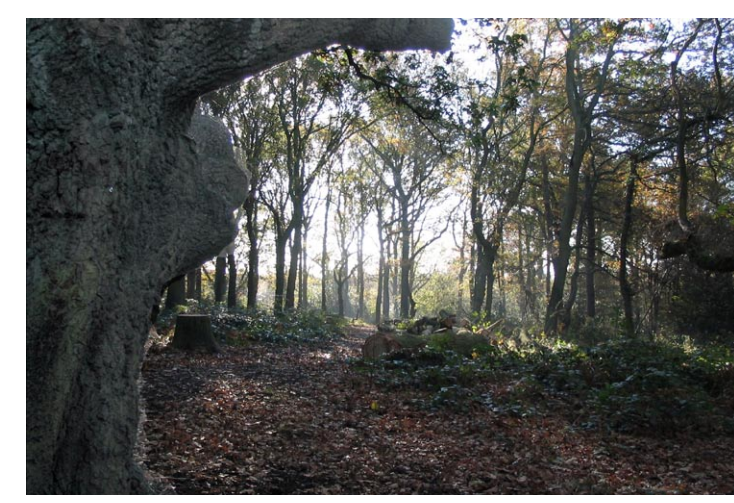
Woodland management at Yorks Wood,

Although this zone forms part of the heavily urbanised west midlands conurbation and is separated from the wider landscape by large transport infrastructure, there are remnants of the Arden countryside characteristics in the woodlands of Smith's Wood, York's Wood, Meriden Park Wood and Alcott Wood and through parts of Kingfisher Country Park. These remnants and their position on the edge of the built up area make the landscape character relevant to this strategy and the future green space design in North Solihull. Re-establishing green links to the wider countryside are important.