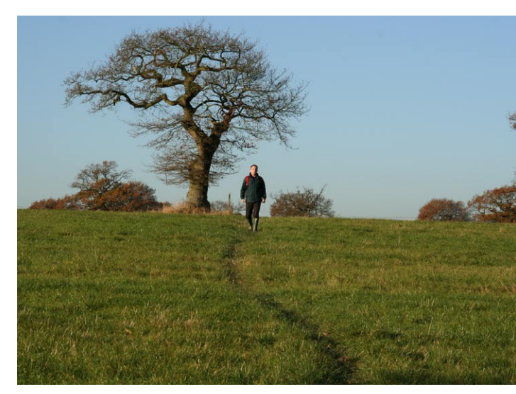
Footpath across Solihull's countryside

The Council's Walking Strategy 2009-2014, seeks to promote walking as a recreational leisure activity and one of the Strategy's aims is to work with Sustrans and other stakeholders to provide improved links to recreational routes. Links between the urban area