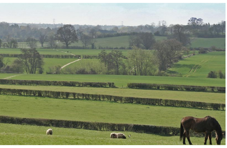
Solihull's countryside around Hampton-in-Arden

Solihull's countryside has many strengths; it is an attractive area where the quality of the landscape (the results of the interaction of both natural and human influences on the area) has generally been retained with a strong rural character, providing a major contrast with adjacent urban areas.