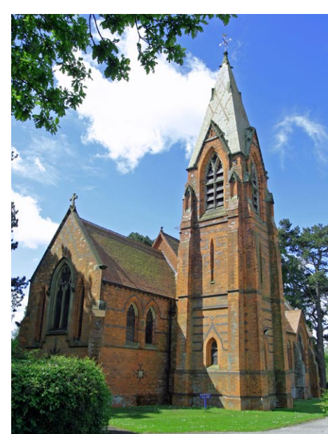
St. Thomas' Church, Hockley Heath

The New Village of Dickens Heath was designed to make best use of existing topographical features and landscape setting. It is largely contained within strong physical boundaries defined by the Stratford-upon-Avon Canal to the north-east and south-eastern boundaries, Braggs Farm Lane and the Country Park to the South, with existing housing and woodland defining the north western boundary.