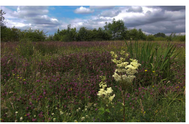
management Healthy landscapes are crucial for conserving

Regional strategy documents provide advice on rural regeneration emphasising "access to opportunity and the number and quality of jobs available within sustainable rural communities."