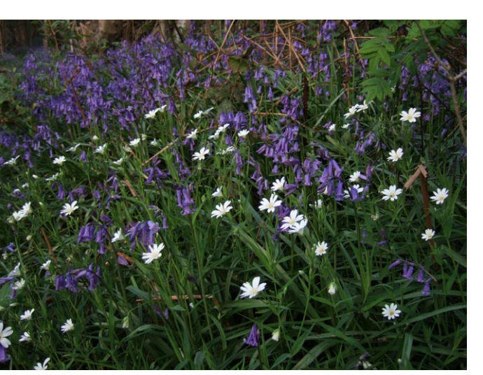
Bluebells and Stitchworts, Millisons Wood LWS/LNR

Hedgerows are a special feature of Arden and they have been preserved well in parts of Solihull, such as in Hockley Heath Parish, but there has been less success elsewhere. The monitoring of these Arden character features is undertaken through the Campaign to Protect Rural England's hedgerow survey and through the Habitat Biodiversity Audit.