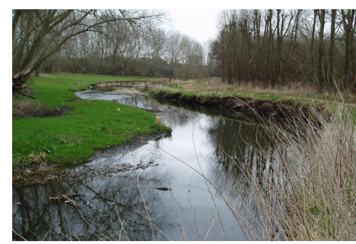
River Cole, which flows east through the borough where it joins the River Blythe

The River Trent Flood Management Plan has been produced by the Environment Agency (EA) to understand how the catchment of the river behaves and to develop a sustainable approach to flood risk management over the next 50 - 100 years. The EA intends to encourage land use change, such as in farming practices and through increases in areas of wetland. Sustainable river maintenance and river restoration will result in a landscape and river system that slows down the response to rainfall, which will not allow widespread unmanaged and damaging flooding to occur.