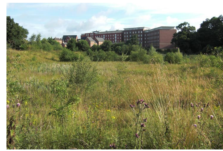
Dickens Heath (from Dickens Heath LNR)

It can be argued that urban fringe issues arise across the Borough wherever an urban edge is in iuxtaposition with the countryside. However, the distinction between urban and rural areas and the nature of the urban fringe are far from clear cut. Despite this, it is evident that Solihull's countryside has been and continues to be the subject of considerable urban pressures. These pressures take many forms and operate over both short and longer timescales being generated by forces within and beyond the Borough.