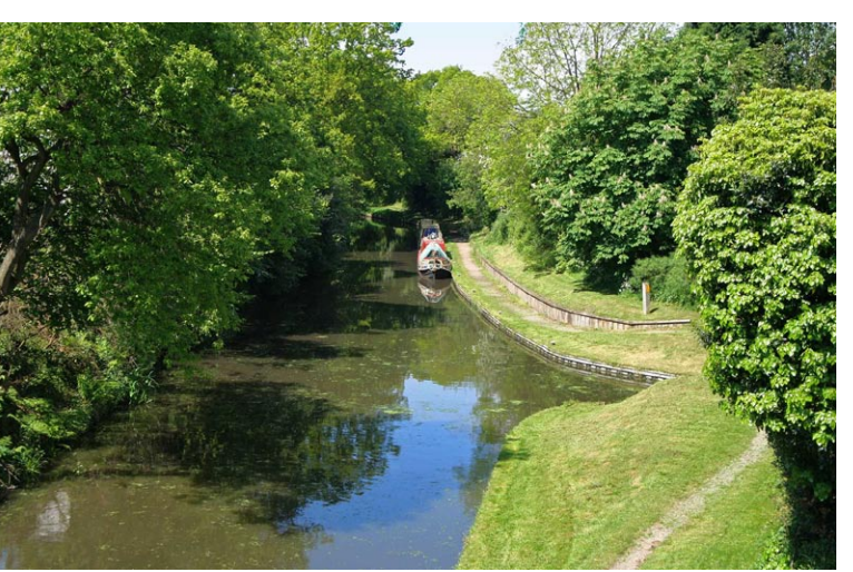
The Stratford-upon-Avon Canal at Hockley Heath

the enjoyment of, or access by people with disabilities, senior citizens or families with young children.