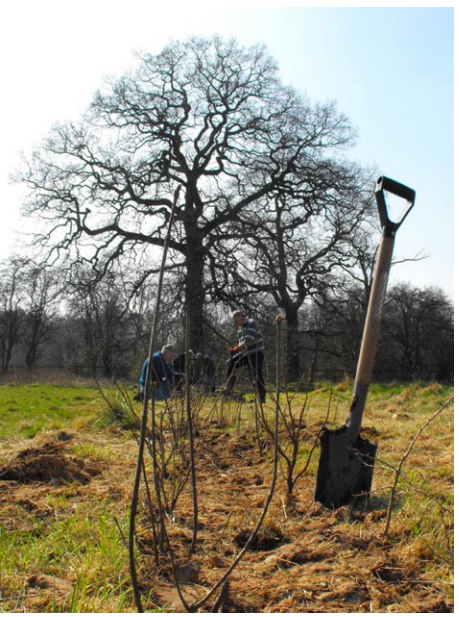
Planting Hacket's Hedge, Brueton Park LNR

Pressures for development and intensive agriculture have placed enormous strains on Solihull's natural environment. The Council will support regional and sub-regional partnerships that identify potential biodiversity and geodiversity assets and encourage the sensitive management of these assets. Linking known sites and creating a functional resilient landscape adaptable to climate change and other potential environmental impacts.