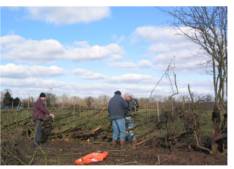
Hedge laying at Lavender Hall LNR

Solihull has a number of nature reserves, parks country parks and farms which are managed by a variety of organisations (with essential support from volunteers) to improve their biodiversity value. A specific project exists to deliver Woodland Management in two of Solihull's principal parks (Elmdon and Brueton), which are under ten year Countryside Stewardship Management agreements. Natural England provides management prescriptions for SSSIs which farmers and landowners are required to adopt. The Council will work towards achieving the targets for LAA NI197 by ensuring that all land in its ownership will meet the targets and encouraging the achievement of positive conservation management on land in private ownership through support of the Wildlife Sites Partnership.