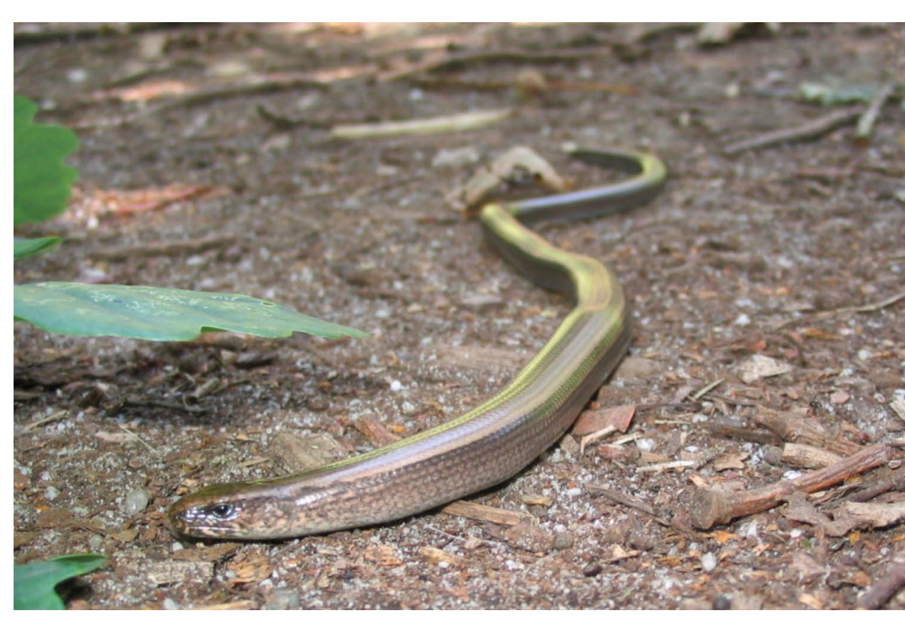
The Slow worm is protected under European and UK law.

For wetlands, hydrology, water quality and the transitional zone between aquatic and terrestrial habitats are all critical components of priority species requirements.