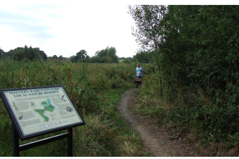
Signage at Malvern and Brueton LNR

The provision and maintenance of a healthy, sustainable and attractive natural environment is an essential element in ensuring continuing economic prosperity as it contributes to quality of life. The natural environment is a public health asset and helps foster favourable perceptions of the Borough as a place in which to live and invest. It's also good for biodiversity.