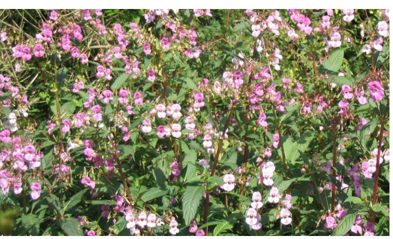
Himalayan balsam at Brueton Park