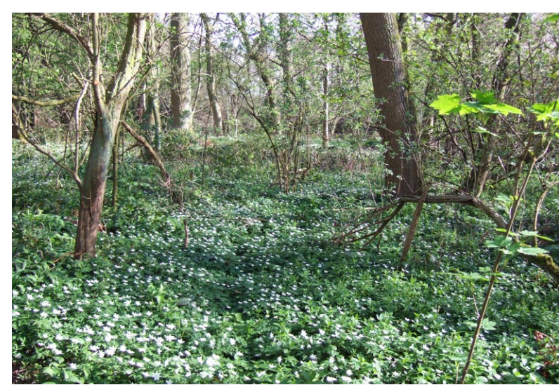
Woodland at Brueton Park

There are two main types of woodland found throughout Solihull; ancient semi-natural and secondary woodlands. Ancient semi-natural woodlands are remnants of the Forest of Arden, dated from 1600 or earlier. Dominant trees are typically oak and birch and ash with small-leafed lime in places. Characteristic ancient woodland ground flora includes vellow archangel, wood anemone and bluebells.