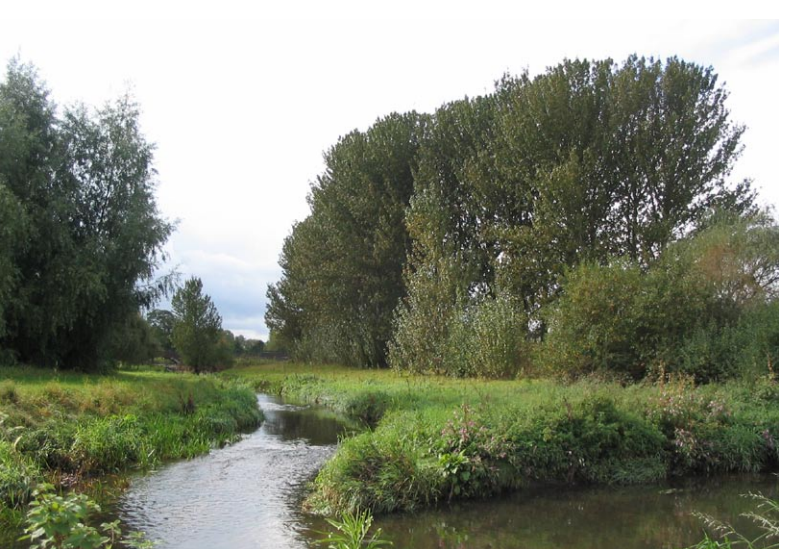
Cole Bank LNR