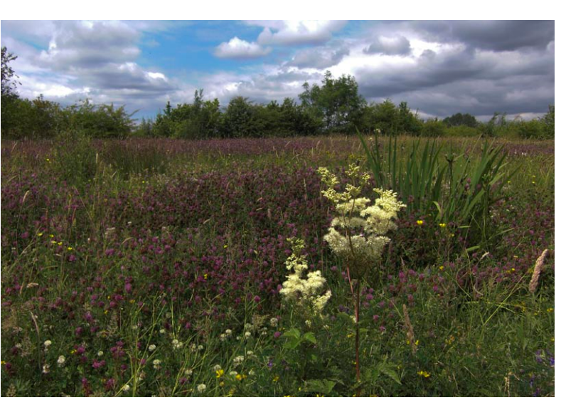
Grassland at Blythe Valley