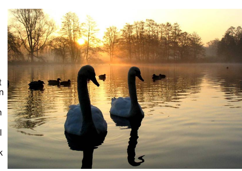
Swans at sunrise, Elmdon

There are a variety of ponds and lakes found across the Borough providing standing water habitat. Lakes are an important feature of many parks in Solihull, providing a haven for wildfowl and fish. Lakes are also formed at gravel pit extraction sites, for example, Ryton End in Barston and at Cornets End in Meriden. Lakes have a high amenity and recreation value too. Many countryside ponds in Solihull occur in the corner of fields and were traditionally used for livestock to drink. These are becoming gradually overshaded and dried up and sadly, many are being lost.