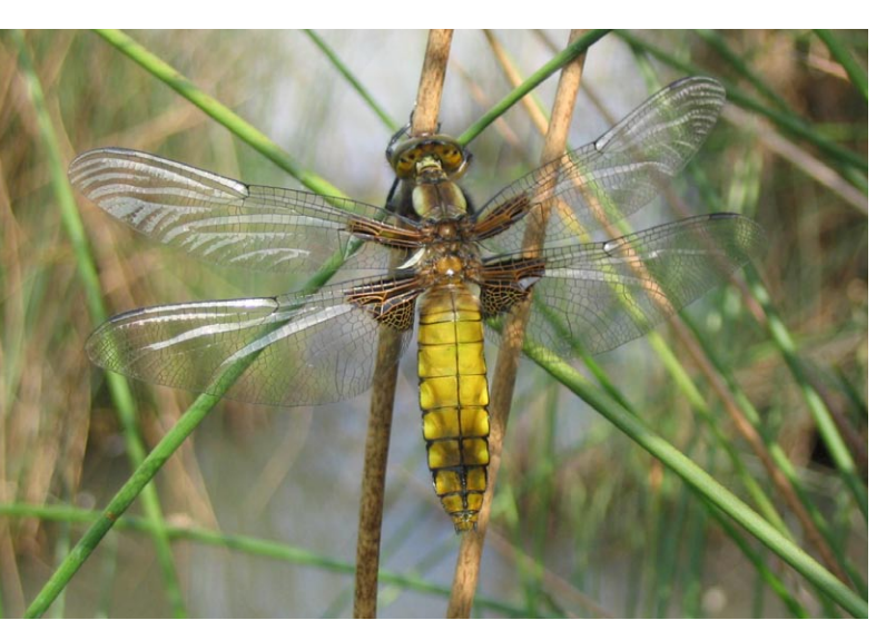
UK BAP Priority Habitats and Species

Nationally, the Government has prepared a list of habitats and species of principal importance for biodiversity conservation based on the UK Biodiversity Action Plan priorities. Local Authorities are expected to contribute towards achieving the targets for the listed habitats and species.