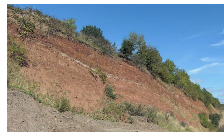
Arden Brickworks LGS

The majority of the underlying rock in Solihull is the Triassic Mercia mudstone formation, consisting of red marls and siltstone. This material has formed the basis of an extensive brick making industry during the 18th and 19th Centuries, a remnant of which can be seen at Nursery Cottage (Arden) Brickworks Local Geological Site (LGS), along the A45, near Stonebridge. There are several outcrops of Arden Sandstone in the south-east of