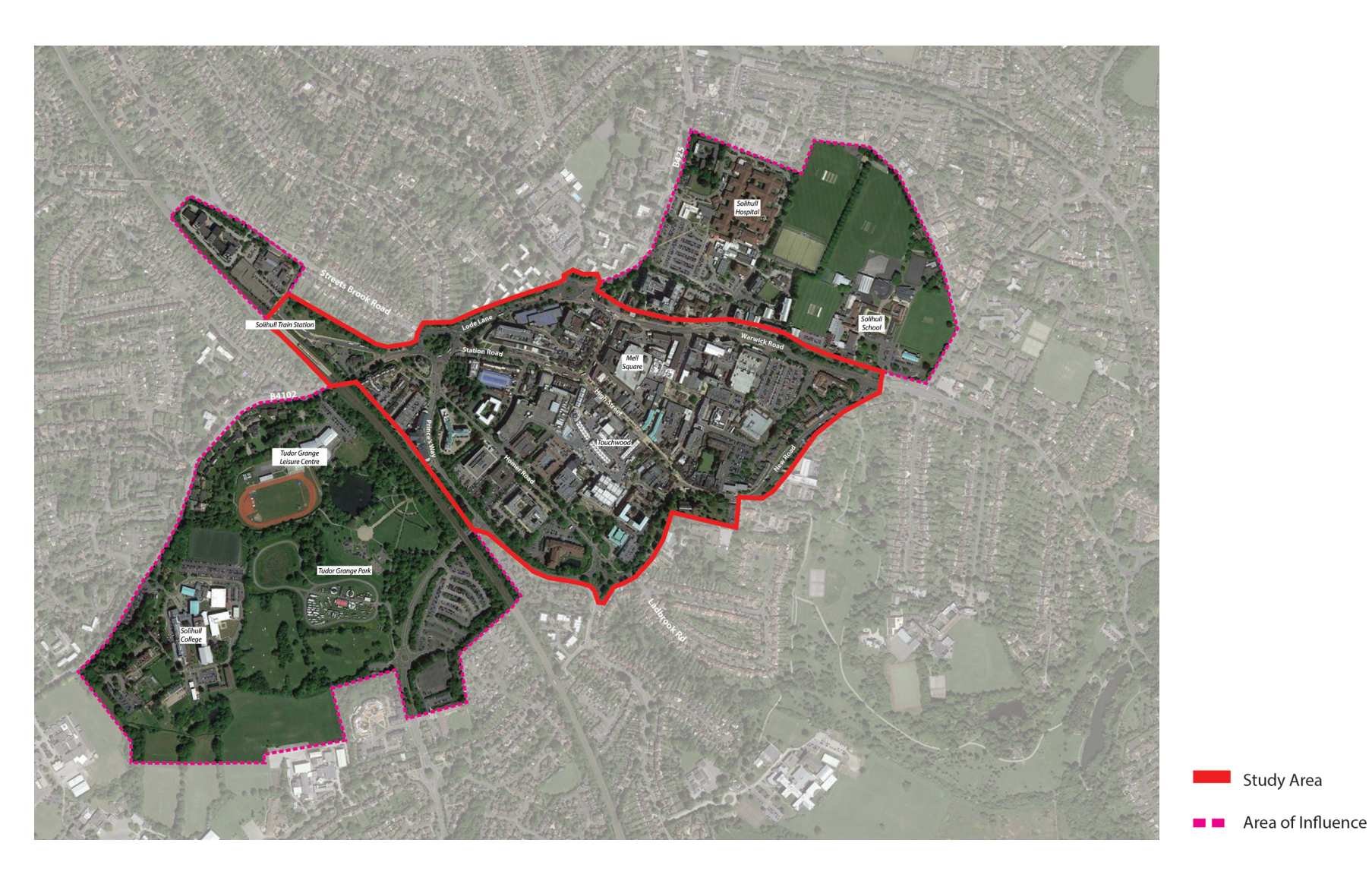
Fig 1.2 Extent of the Solihull Town Centre Masterplan Study Area and associated Area of Influence.