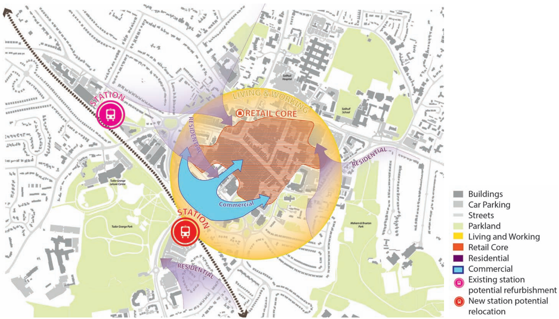
Figure 8.2: Concept of the future living and working strategy for Solihull Town Centre